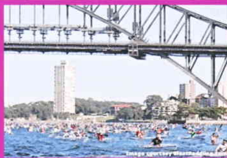
A sea of paddlers begins the race.