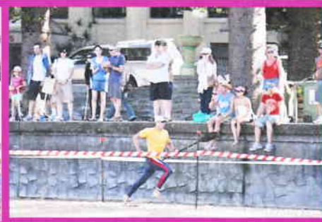
A competitor sprints to the finish.